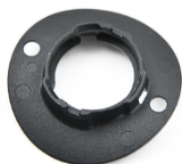
ADAPTERPLATTE TYP B curved, lateral