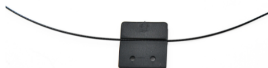
DIRECTOR TYP 2