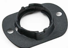
ADAPTERPLATTE TYP A curved, narrow