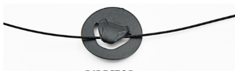
DIRECTOR TYP 4

We also have various standard rope deflectors in our range. These guide the rope in a defined position and help to achieve optimum force distribution. The rope is clicked into the guides, making it easy to replace or install.