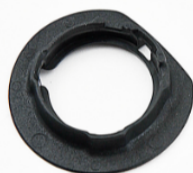
ADAPTERPLATTE TYP C round, flat