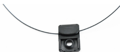
DIRECTOR TYP 1