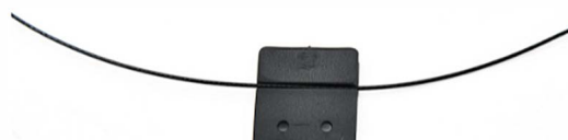
CONDUCTOR TYP 2