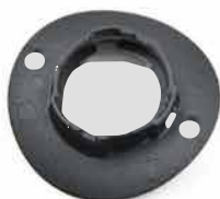
ADAPTER PLATE TYP B curved