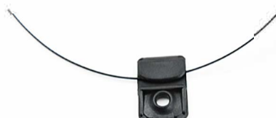
CONDUCTOR TYP 1

In addition, our product range includes various standard rope deflection units. These units guide the rope in a defined position, helping to achieve optimal force distribution. The rope clicks into the guides, simplifying replacement or installation.