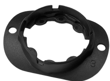
ADAPTER PLATE TYP A curved, narrow