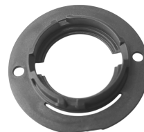
ADAPTER PLATE TYP A curved, narrow